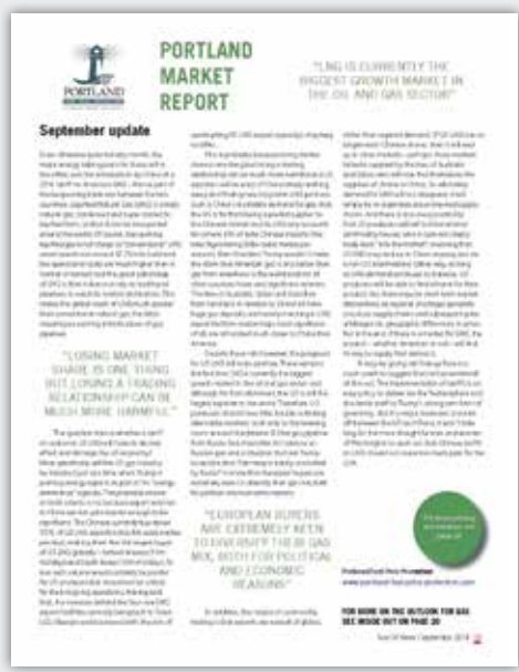
Chinese tariffs on LNG covered in the August 2018 update – a ‘humdinger’ of a report

50 reports later (June 2014) and we were discussing the impact of currency on oil prices and how it was always an overlooked factor behind rising fuel costs in the UK. This is a subject that we have revisited on many occasions and is highly relevant today, as the £ crashes to hitherto uncharted, rock-bottom levels. With the current wholesale (Rotterdam) price of diesel around the $1,200 mark and with the exchange rate around 1.09 ($ – £), this gives a diesel price (pre-duty and VAT) of 93.06 pence per litre (ppl). Only 6 weeks ago, the exchange rate was riding at the relatively buoyant level of 1.20, which at the same wholesale level ($1,200) would have given a price 84.53ppl – a full 8.50ppl less. For a modest bus company buying 20,000 litres per week, this means they are incurring extra costs